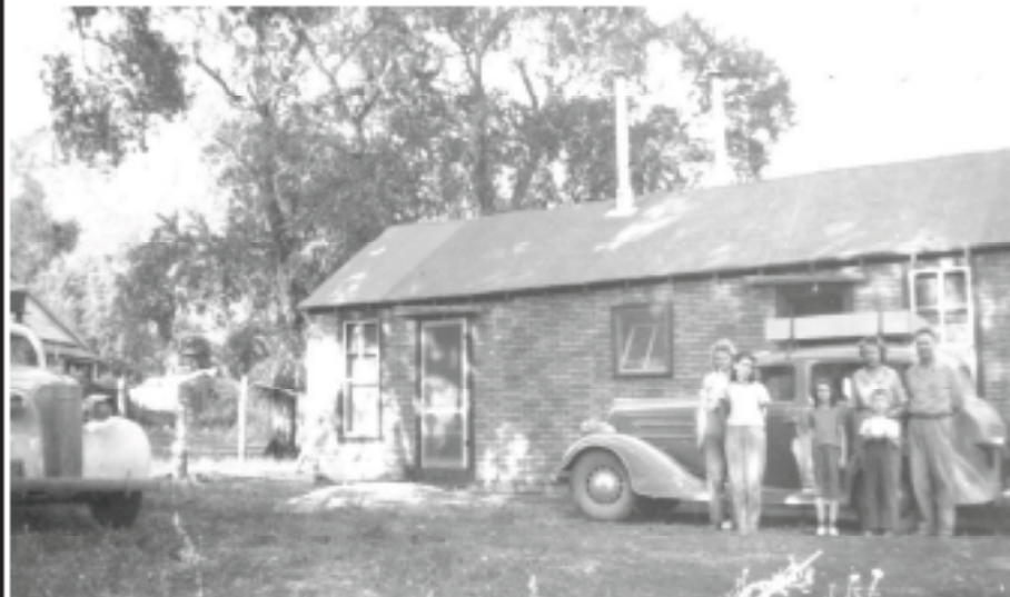
Location of the New Mandela Pizza!

Laundromat: 191 E Galena Ave Open 7 Days a Week 8 a.m. to 5 p.m.